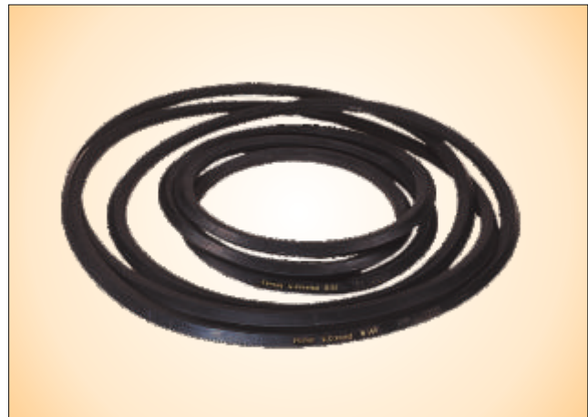
V- Crested Belts for Ceramic Tile Industry