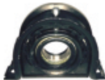
JKP Part No : A10672 Eicher - Canter 1110 Center Bearing Assembly W/Brg. (6011) (3 Bolt Type) (With Bracket)