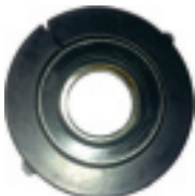
JKP Part No : A10630 TATA MOTORS - 1312 Center Bearing Assy. (Cut Type) WBRG 6208 (Comp)