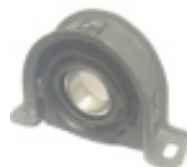
JKP Part No : A10645 TATA MOTORS - 4018 Centre Bearing Assy.(3 Spokes) W/Brg. 6211 (Spicer Type) (68 Mm-Cup) W/Bkt