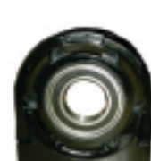
JKP Part No : A10641 TATA MOTORS - 3718 / BHARAT BENZ Center Bearing Rubber With Bearing 6011 (2Rs)