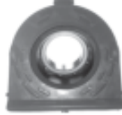
JKP Part No : A10251 TATA MOTORS - 3118 with Bearing Assembly Complete (6012) for Spicer Shaft