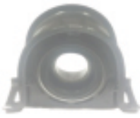
JKP Part No : A10643 TATA MOTORS - 2518 N/M Center Bearing Assembly W/Brg. 6211(Comp.) (2 Rs) W/Bkt.