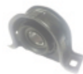
JKP Part No : A10650 TATA MOTORS - 407 Turbo Centre Bearing Assembly (Spicer Type) W/ Brg. 88507 W/Bracket