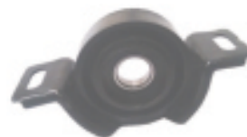
JKP Part No : A10690 MAHINDRA - Quanto 6006 Centre Bearing Assy. (With Bearing)