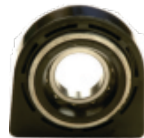
JKP Part No : A10629 TATA MOTORS - 709 / 92 Model Center Bearing Assy (Bush) W/Brg. 6208