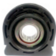
JKP Part No : A10685 MAHINDRA - Scorpio CRDE Centre Joint Assy. W/Brg. 88507