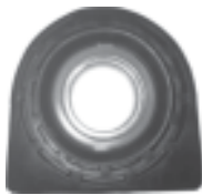
JKP Part No : A10192 Leyland / TATA 4018 3 Lock Type, with Bearing Assembly Complete (62211) 72mm Cup