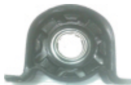
JKP Part No : A10681 Force Motors - Trax Centre Bearing Assembly W/Bearing & Bracket