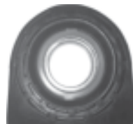
JKP Part No : A10193 Leyland Taurus with Bearing Assembly Complete (6011)