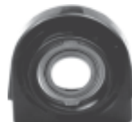
JKP Part No : A10194 Leyland Cargo / TATA 909 NM / Starbus with bearing assembly complete (88508) 3 Lock