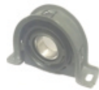
JKP Part No : A10646 TATA MOTORS - 4018 Centre Bearing Assy. (3 Spokes) W/Brg. 6211 (72mm-Cup) (Rsb Type) W/Bkt