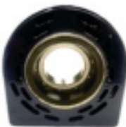
JKP Part No : A10636 TATA MOTORS - Hywa Centre Bearing Assy. (Bush) W/Bearing 6015 (2 Rs)