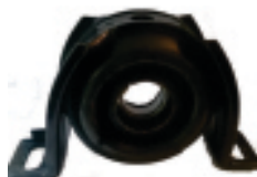
JKP Part No : A10692 MAHINDRA - M Hawk 6006 Centre Bearing Assy. (With Bearing)