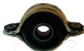
JKP Part No : A10693 GENERAL MOTORS - Enjoy Centre Bearing Assy.