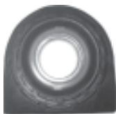
JKP Part No : A10250 TATA MOTORS - '92 Model (1510 / 1612) with Bearing Assembly Complete (6208)