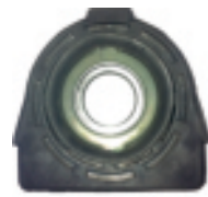
JKP Part No : A10638 TATA MOTORS - 709 N/M Centre Bearing Assembly (3 Spokers) W/Bearing 88507