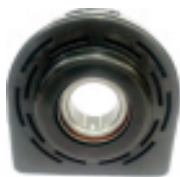
JKP Part No : A10683 MAHINDRA - Scorpio Centre Bearing Assembly W/ Bearing 88507