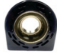
JKP Part No : A10621 TATA MOTORS - 2518 N/M Centre Bearing Assy. With Bearing 6211 (2 Rs)