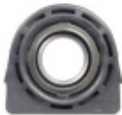
JKP Part No : A10654 TATA MOTORS - 4018 Centre Bearing Assy. (2 Spokes) W/Brg. 6211 (68mm-Cup)