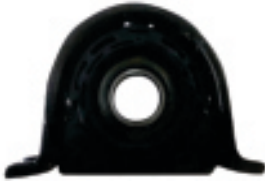
JKP Part No : A10295BR TATA MOTORS - 98 Model (TC) 3 Lock Bearing Assy 88509 with Bracket