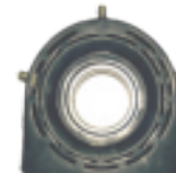
JKP Part No : A10671 Eicher - Canter 1110 Center Bearing Assembly W/Brg. (6011) (3 Bolt Type)