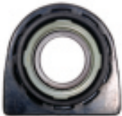
JKP Part No : A10628 TATA MOTORS - Euro III, 2515 Ex Centre Bearing Assembly 3 W/ Bearing. 88511