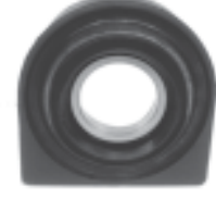
JKP Part No : A10278 TATA MOTORS - 3118 with Bearing Assembly Complete (6013 2RS)