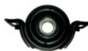
JKP Part No : A10680 MAHINDRA - Xylo C.b. Assembly W/Bearing With Fag Bearing 6006 (W/Bracket) Xylo