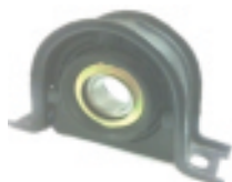
JKP Part No : A10686 MAHINDRA - Scorpio O/M Centre Bearing Assy. W/BRG. 88507 W/BKT. (Comp.) W/BKT