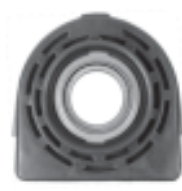
JKP Part No : A10295 TATA MOTORS - 98 model Turbo (TC) 3 Lock Type with Bearing Assembly Complete (88509)