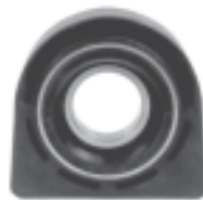
JKP Part No : A10298 TATA MOTORS - 2213 / 2416 with Bearing Assembly 6211 - 2RS, Oil Seal