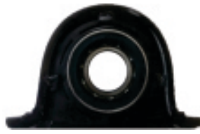
JKP Part No : A10294BR TATA MOTORS - 2213 / 2416 Bearing Assy 6211 with Bracket