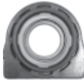
JKP Part No : A10186 Leyland / TATA 4018 2 Lock Type, with Bearing Assembly Complete (88511)