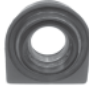
JKP Part No : A10277 TATA MOTORS - 3118 with Bearing Assembly Complete (6013)