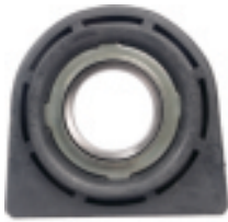
JKP Part No : A10627 TATA MOTORS - 2515 Ex Center Bearing Assy. W/Bearing 6211