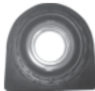
JKP Part No : A10190 Leyland / TATA 4018 2 Lock Type, with Bearing Assembly Complete (62211) 72mm Cup