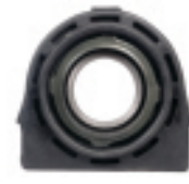
JKP Part No : A10625 TATA MOTORS - 4018 Centre Bearing Assy. (3 Spokes) W/Brg. 6211 (RSB Shaft) (72 Mm-Cup)