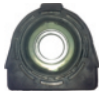
JKP Part No : A10658 TATA MOTORS - 207 Di Centre Bearing Assembly Spicer 243 With Notch 6207