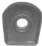
JKP Part No : A10383 Eicher - Canter N/M N/M Plain Type with Bearing