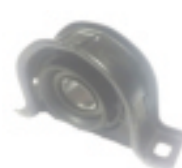
JKP Part No : A10656 TATA MOTORS - 709 N/M Centre Bearing Assembly (3 Spoks) W/Bearing 88507 W/BKT