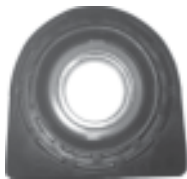
JKP Part No : A10189 Leyland / TATA 4018 2 Lock Type, with Bearing Assembly Complete (62211) 68mm Cup