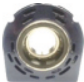
JKP Part No : A10623 TATA MOTORS - 2518 N/M Center Bearing Assy. W/Bearing 6211 (2 Rs) (Cut Type)