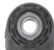
JKP Part No : A10296 TATA MOTORS - 407 Turbo with Bearing Assembly Complete (88507)