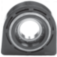
JKP Part No : A10294 TATA MOTORS - 2213 / 2416 with Bearing Assembly 6211, Oil Seal