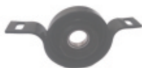
JKP Part No : A10691 MAHINDRA - Xuv 500 Centre Bearing Assy. (With Bearing)