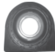
JKP Part No : A10191 Leyland / TATA 4018 3 Lock Type, with Bearing Assembly Complete (62211) 68mm Cup