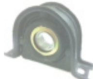
JKP Part No : A10688 MAHINDRA - Scorpio CRDe Centre Bearing Assy. W/BRG. 88507 W/BKT. (Comp.)