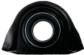
JKP Part No : A1027BR TATA MOTORS - 3118 Bearing Assy 6013 2RS with Bracket