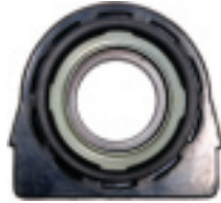
JKP Part No : A10651 TATA MOTORS - 4018 Centre Bearing Assy. (2 Spokes) W/Brg. 88511 (68Mm-Cup) W/Bracket