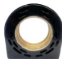
JKP Part No : A10635 TATA MOTORS - Hywa Centre Bearing Rubber (Bush) (Brg. 6015)