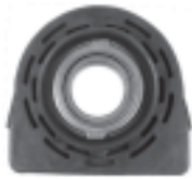
JKP Part No : A10184 Ashok Leyland Spicer (2 Lock Type), with Bearing Assembly Complete (88509)