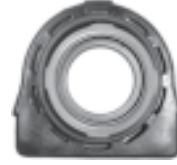
JKP Part No : A10188 Leyland / TATA 4018 3 Lock Type, with Bearing Assembly Complete (88511)