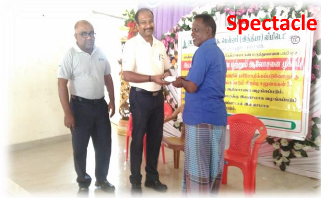
Spectacle Distribution for beneficiaries