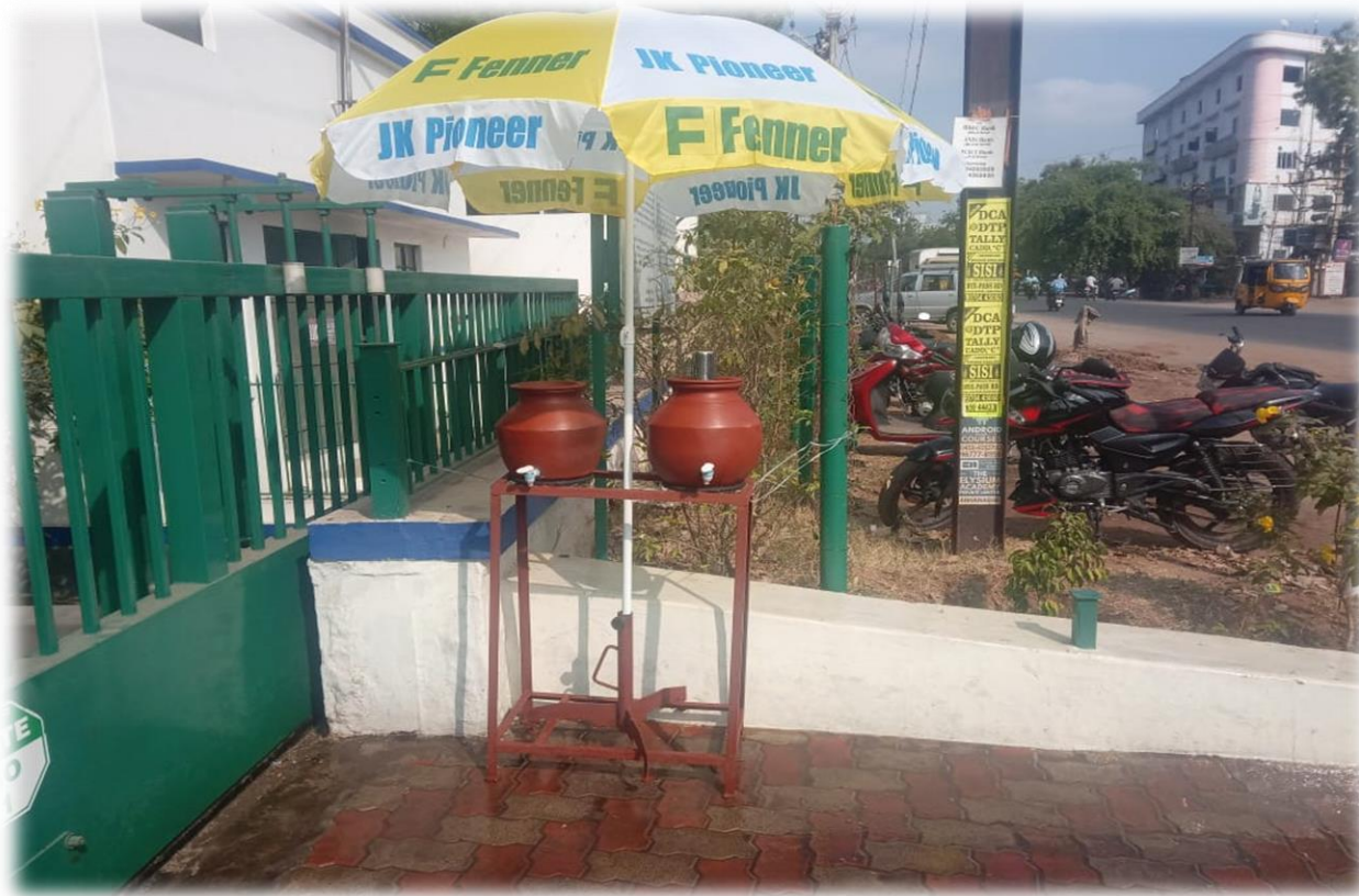
World Water day observed at Madurai on 22 nd March

In view of the World Water day observed on 22 nd March ,we have arranged Drinking water facility outside the Madurai Plant to cater the thirst of the Public this camp will continue till the end of Summer season.