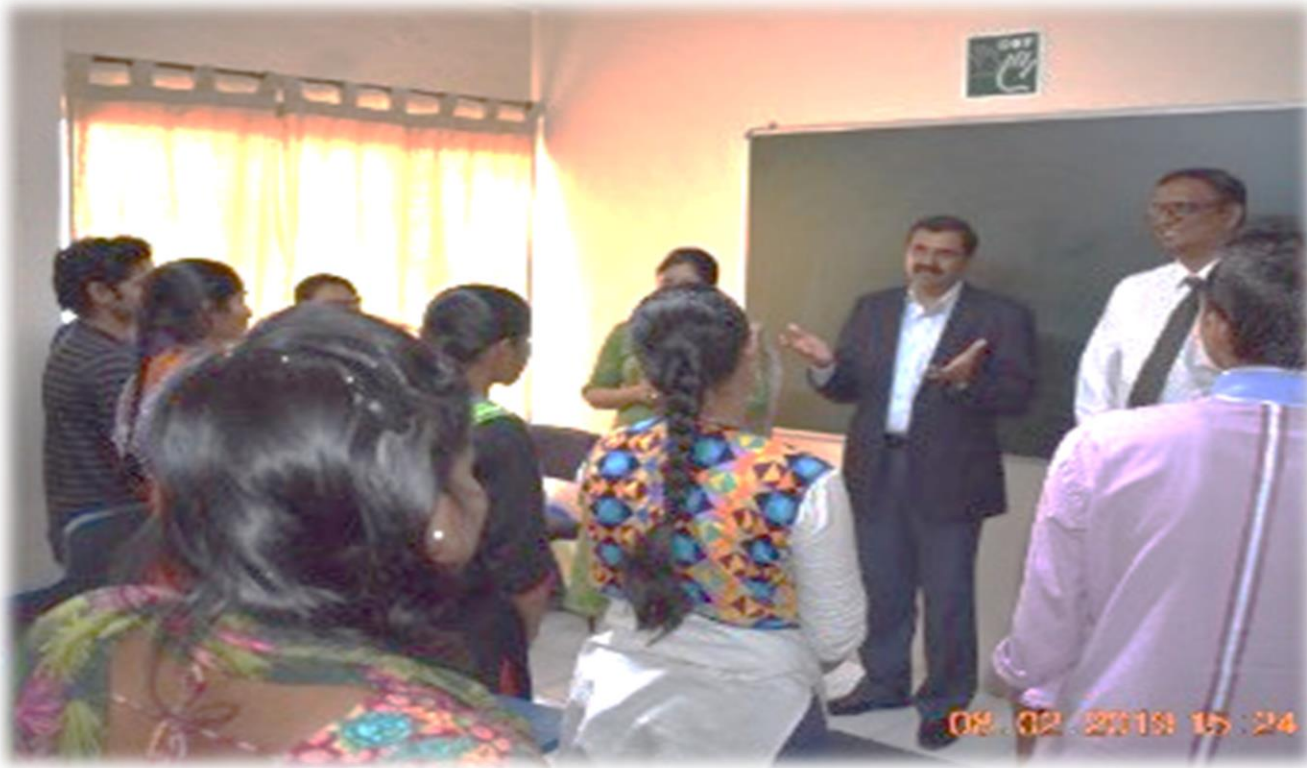
Skill Development Centre at Hyderabad 8 th February 2019

In this Skill Development Centre Differently abled youth (Deaf youth) will be trained in "English, General Skills, Basic IT Skills and Typing Speed Skills. After completion of 3 months Course they will be assisted for Placement in Software industries