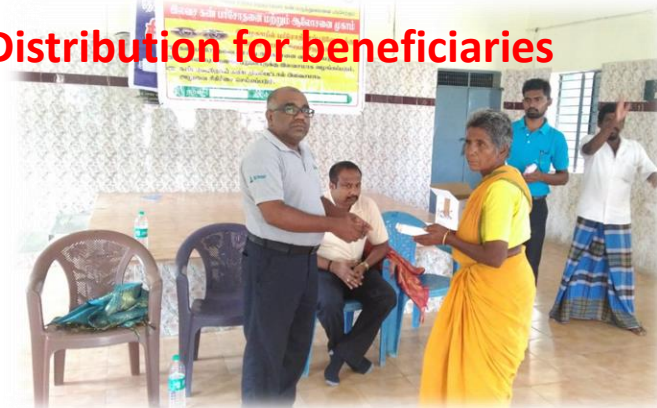
Eye Screening Camp at Paranur Village on 16 th February 2019 (Saturday).

Total of 59 Villagers (21 Male , 38 Female) were screened for their Eye Problems which includes Refractory Disorders also, villagers were given Free Spectacles. (13 Single Vision & 18 Bifocal Lens).