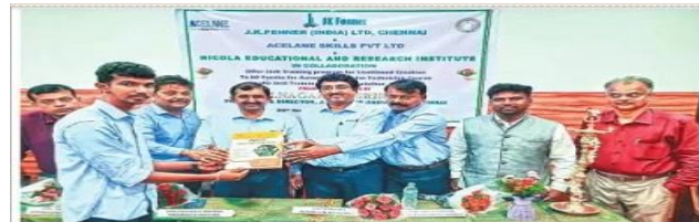
கொளத்தூரில் இலவச தொழில் கல்வி திட்ட முகாம்

In a function for this project the beneficiaries will be trained for Automobile Service Technician course under In the inaugural Batch 30 youth will be trained in the training Centre